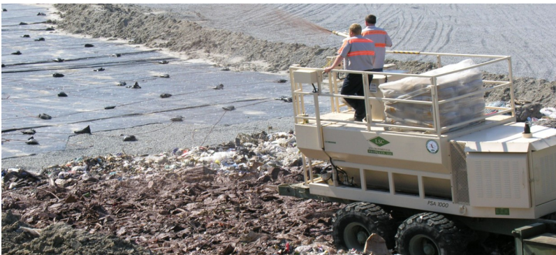
Spraying the liquid material on the garbage

We recently implemented a new method of cover—Posi-Shell®. Posi-Shell® is a spray-applied mineral mortar coating, similar to stucco, that can be used for landfill daily cover, intermediate cover, erosion prevention, and odor control. Imagine pouring chocolate syrup on ice cream and then the chocolate hardens like a shell. You've got the idea.