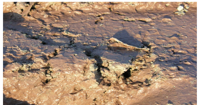
Material after solidifying overnight